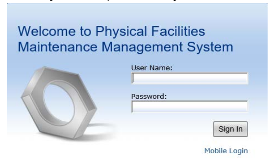
Forgotten Password or New User ? Email Request to:

3. Enter your ID (same as your B-Mail ID, but do NOT enter @binghamton.edu).