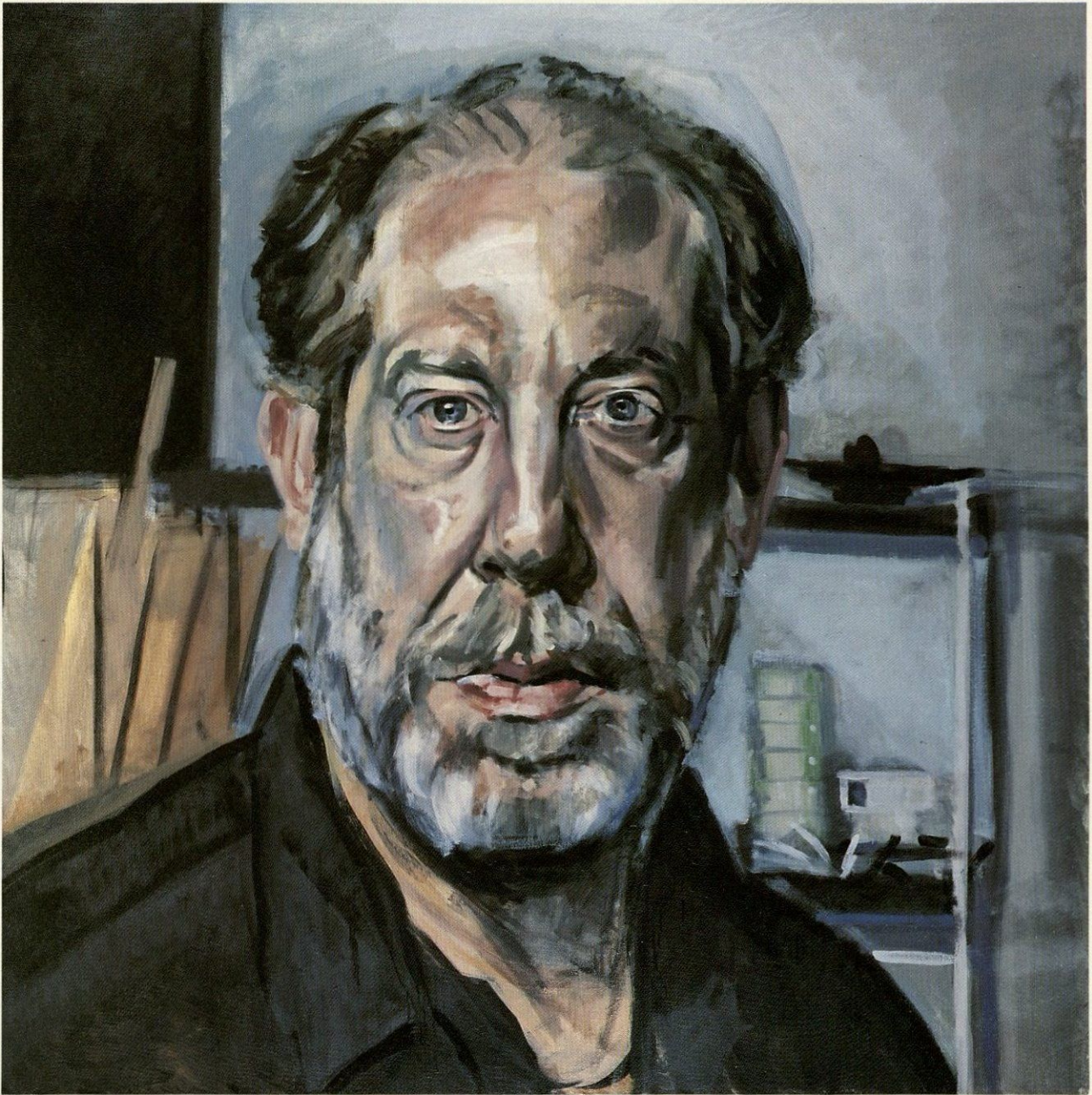
"My Head Sketch," oil on linen, 58" x 58", 1990