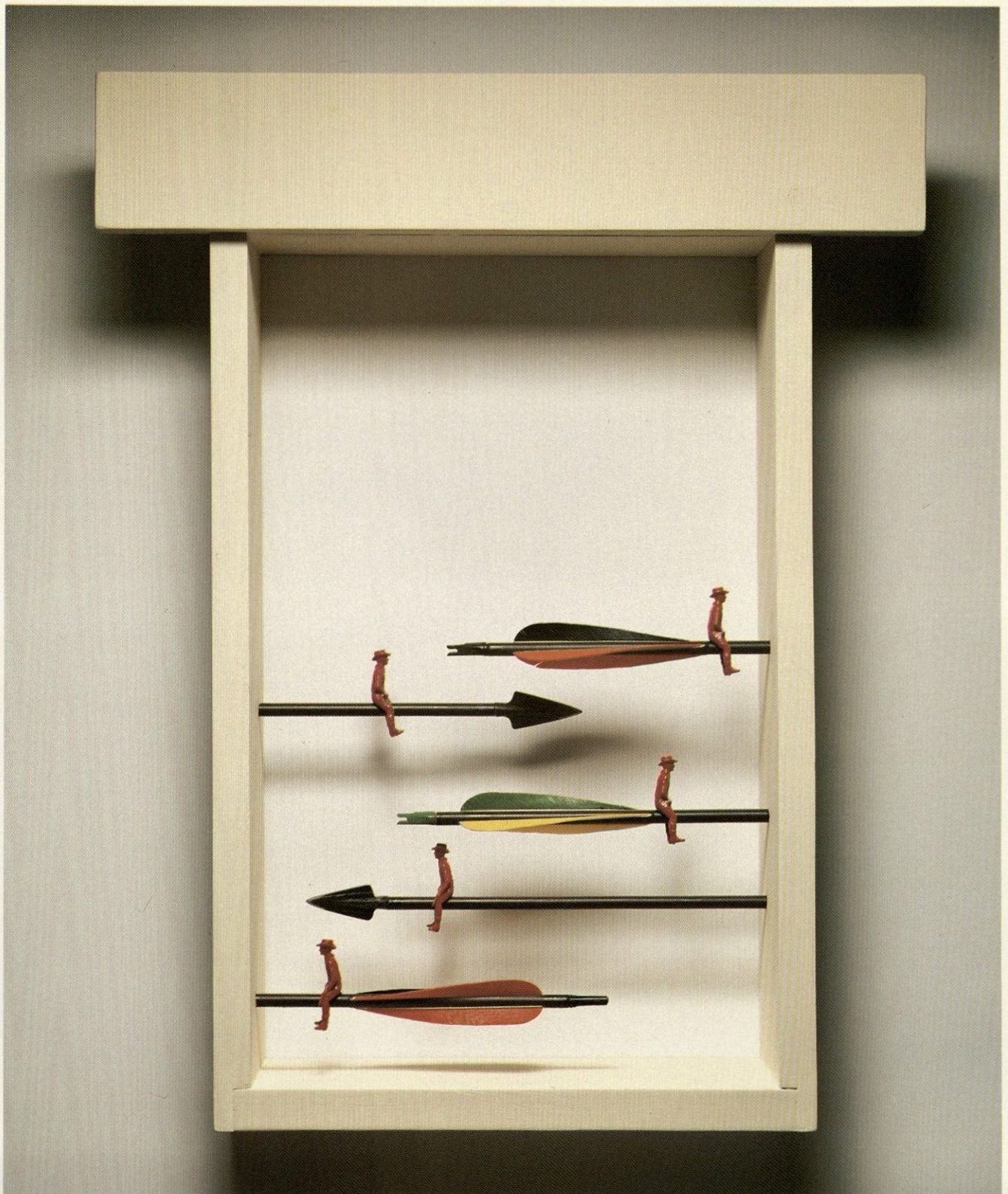
"Window with Straight Shooters," wood, steel, plastic, 27 1/8" h x 21 1/4" w