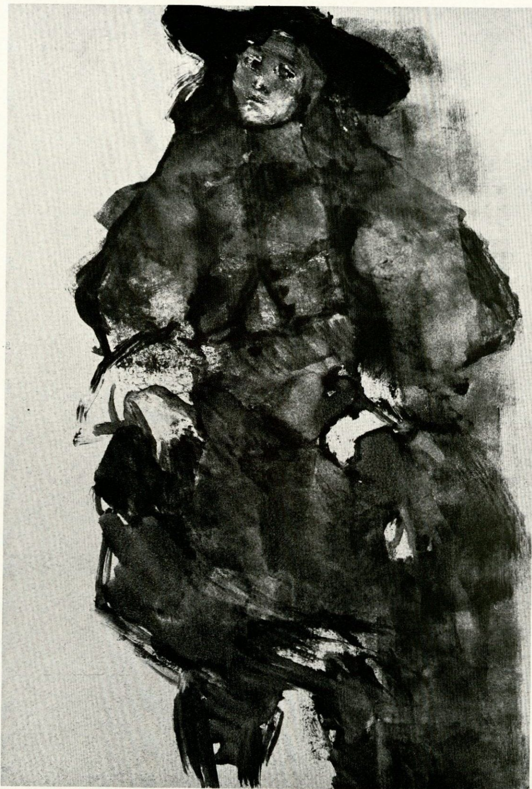
"Imaginary Portrait of Claude Lorrain," monotype, 1986 (from the suite of monotypes "Homage to Claude Lorrain")