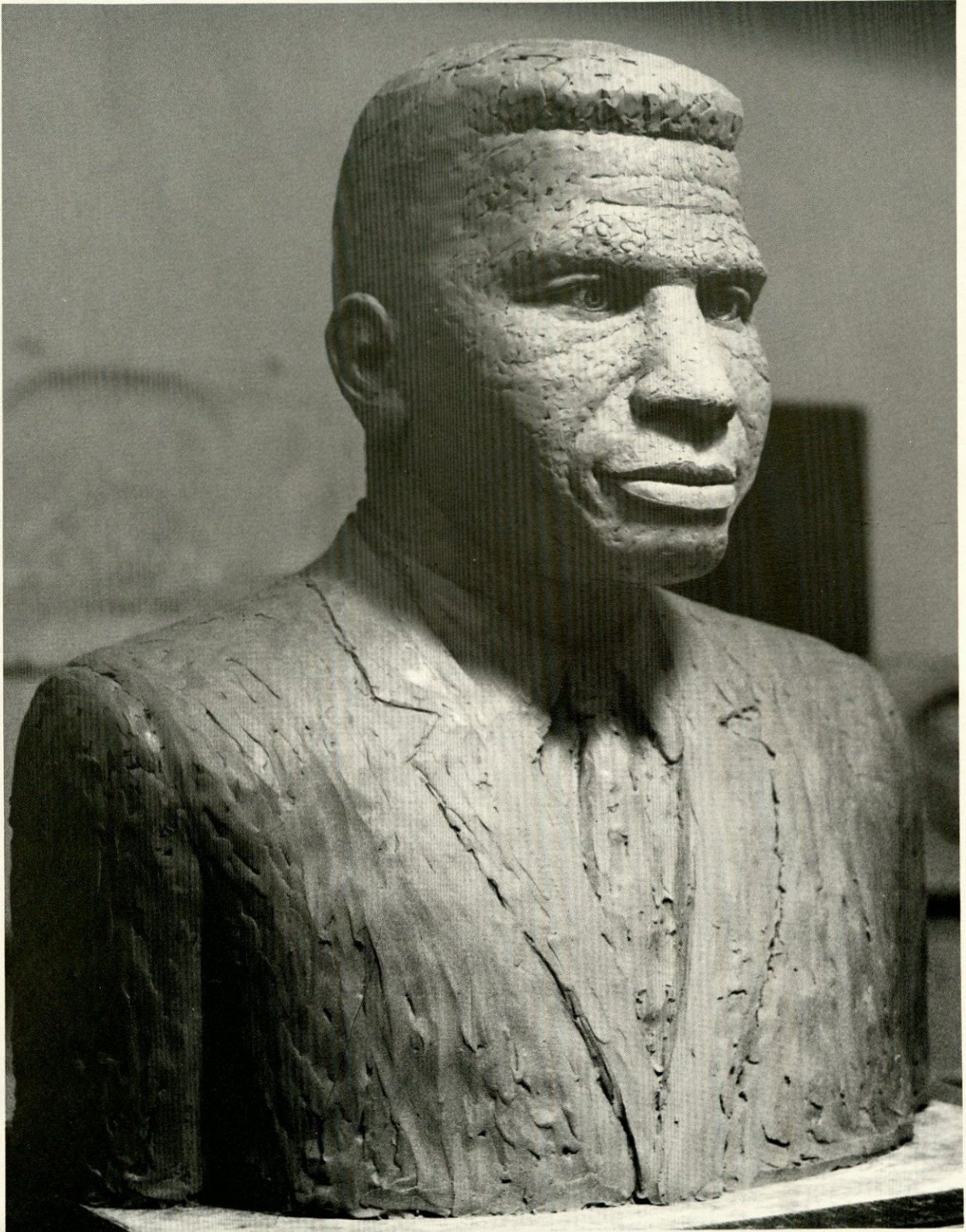
"Medgar Wiley Evers, 1925-1963. Civil rights leader, assassinated June 12, 1963, in Jackson, Mississippi" (work in progress), clay for bronze, 24" h x 21 3/4" w x 13" d (commission for Medgar Evers College, Brooklyn, NY)