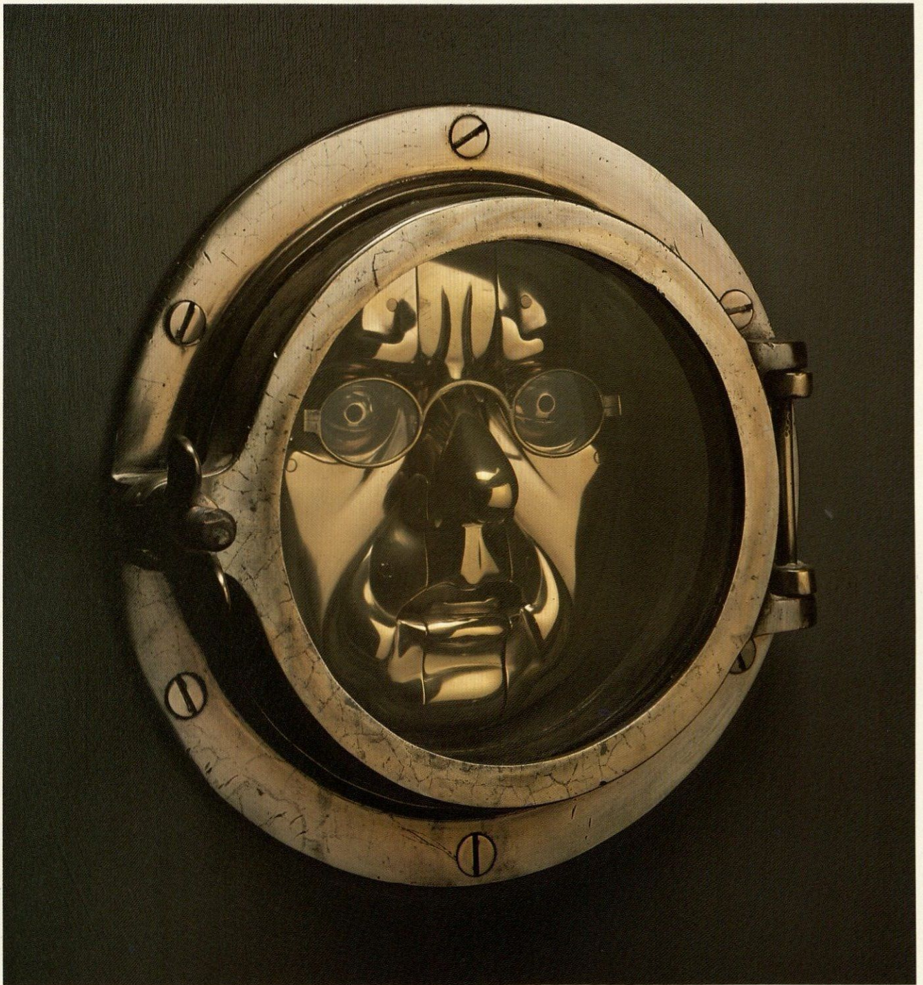
"Portrait of the Artist," brass, bronze, 9" diam, 1988