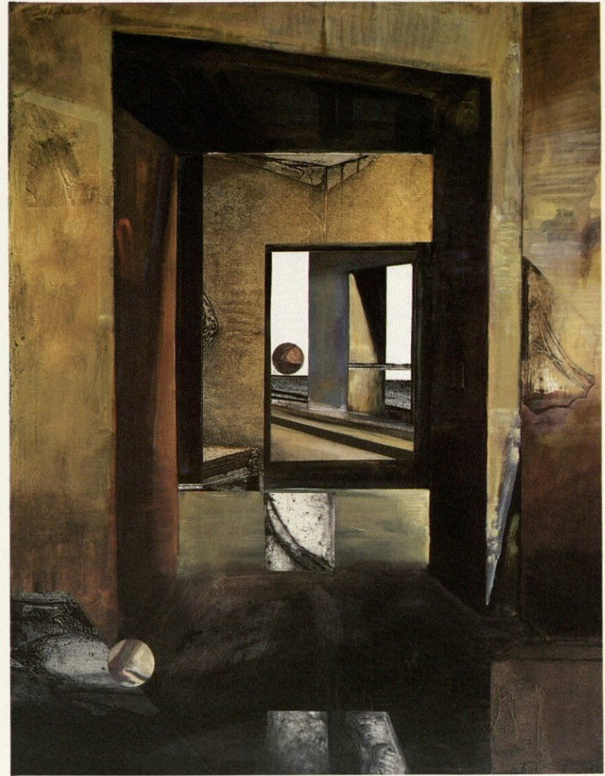
"Roman Labyrinth," diptych, oil and collage, each panel 41" x 32" (41" x 64" overall)