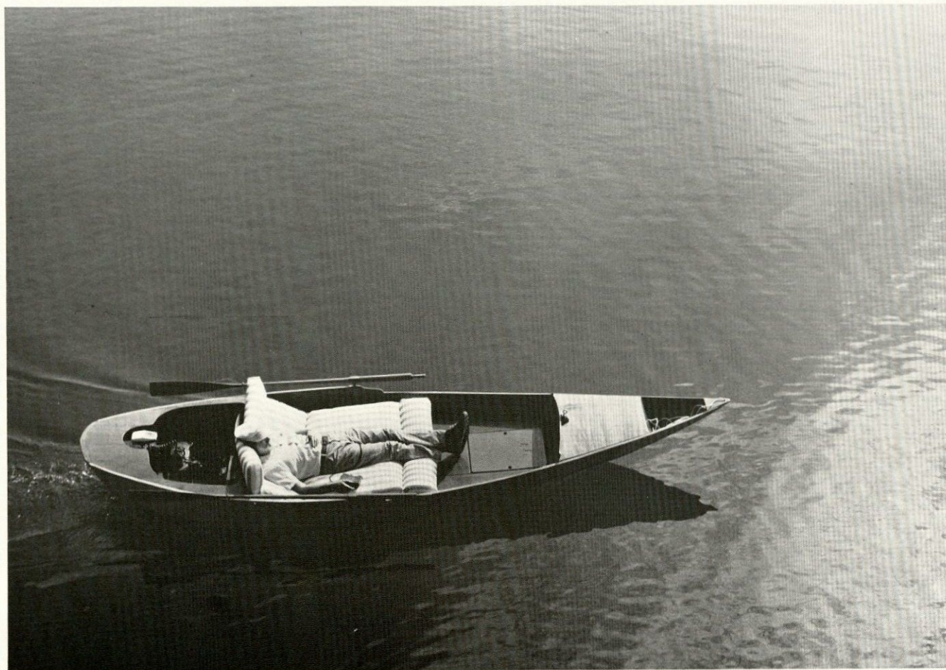
"Electric Boat Prototype," wood, 17'