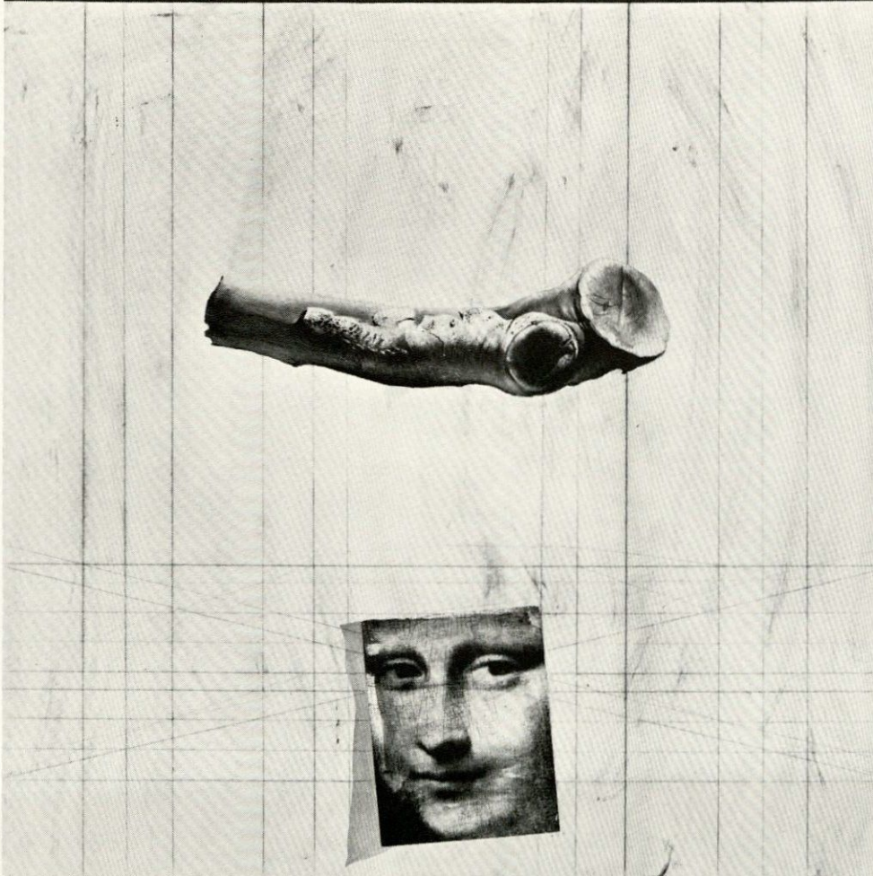
"A Life of the Limbs, Not of Order," oil, collage on linen, 50" x 80", 1990