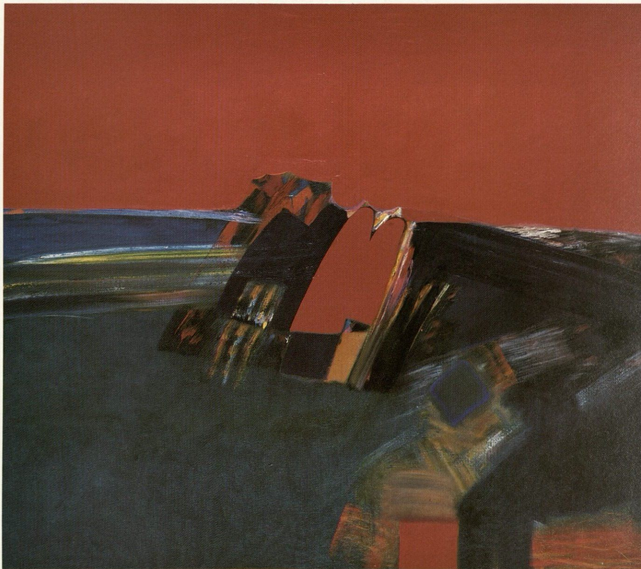
"Ephesus," oil on linen, 62" x 72", 1989