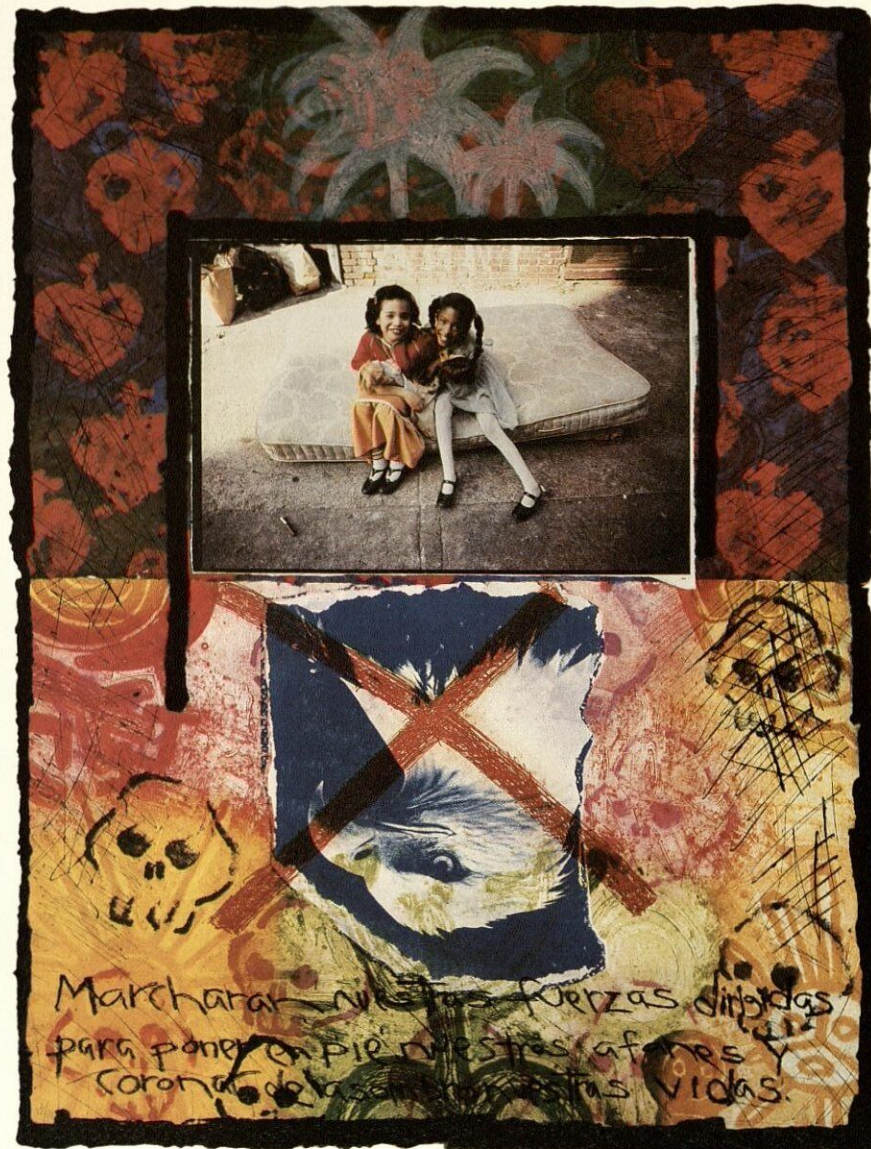
The Heavens/Land/Hope (Cielo/tierra/esperanza) 1990, 58" x 44" collograph, lithography, collage, paper pulp