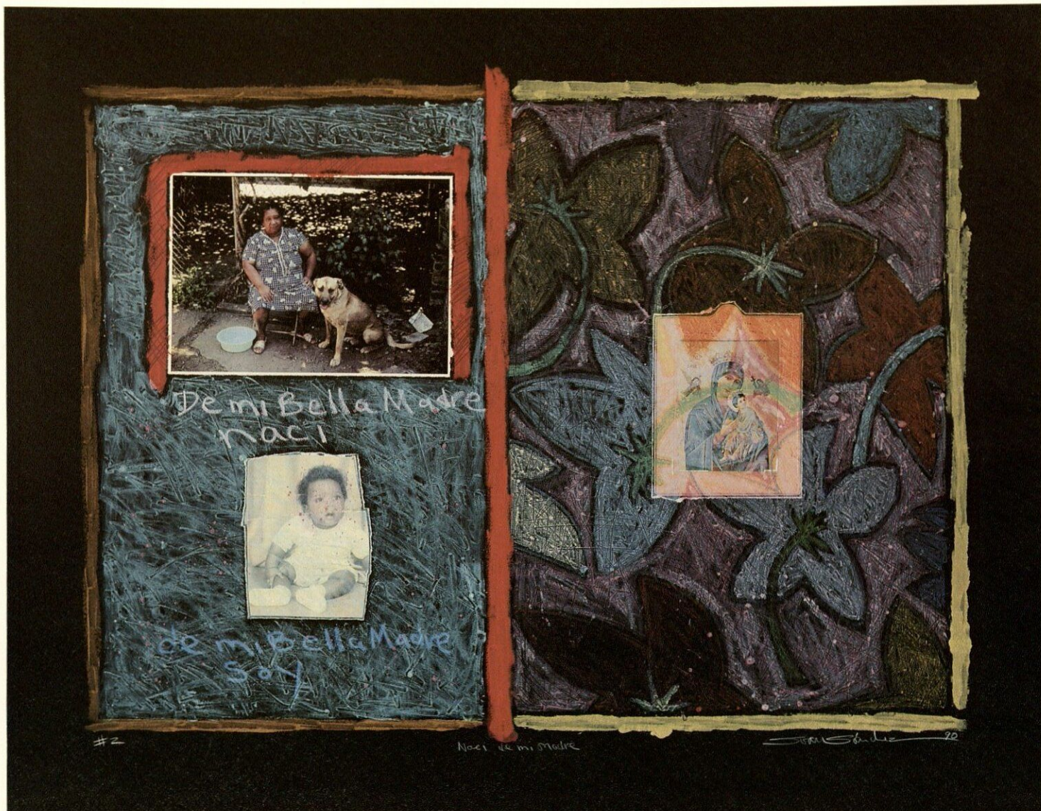
"Naci" of My Mother (Naci de mi madre) 1990, 31" x 41", monotype