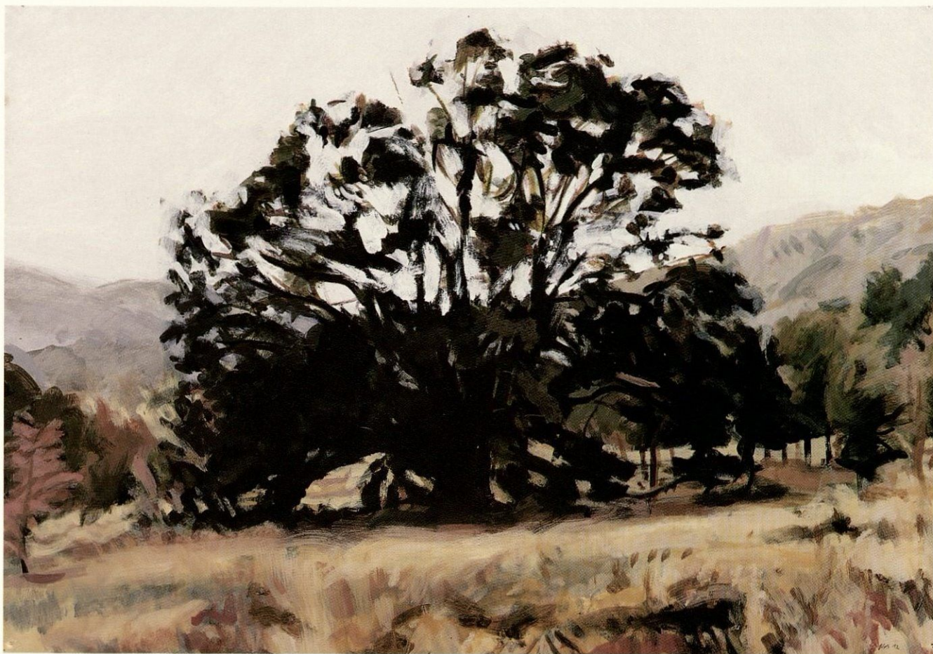
Path for Thelonius, oil on paper , 30 x 40"