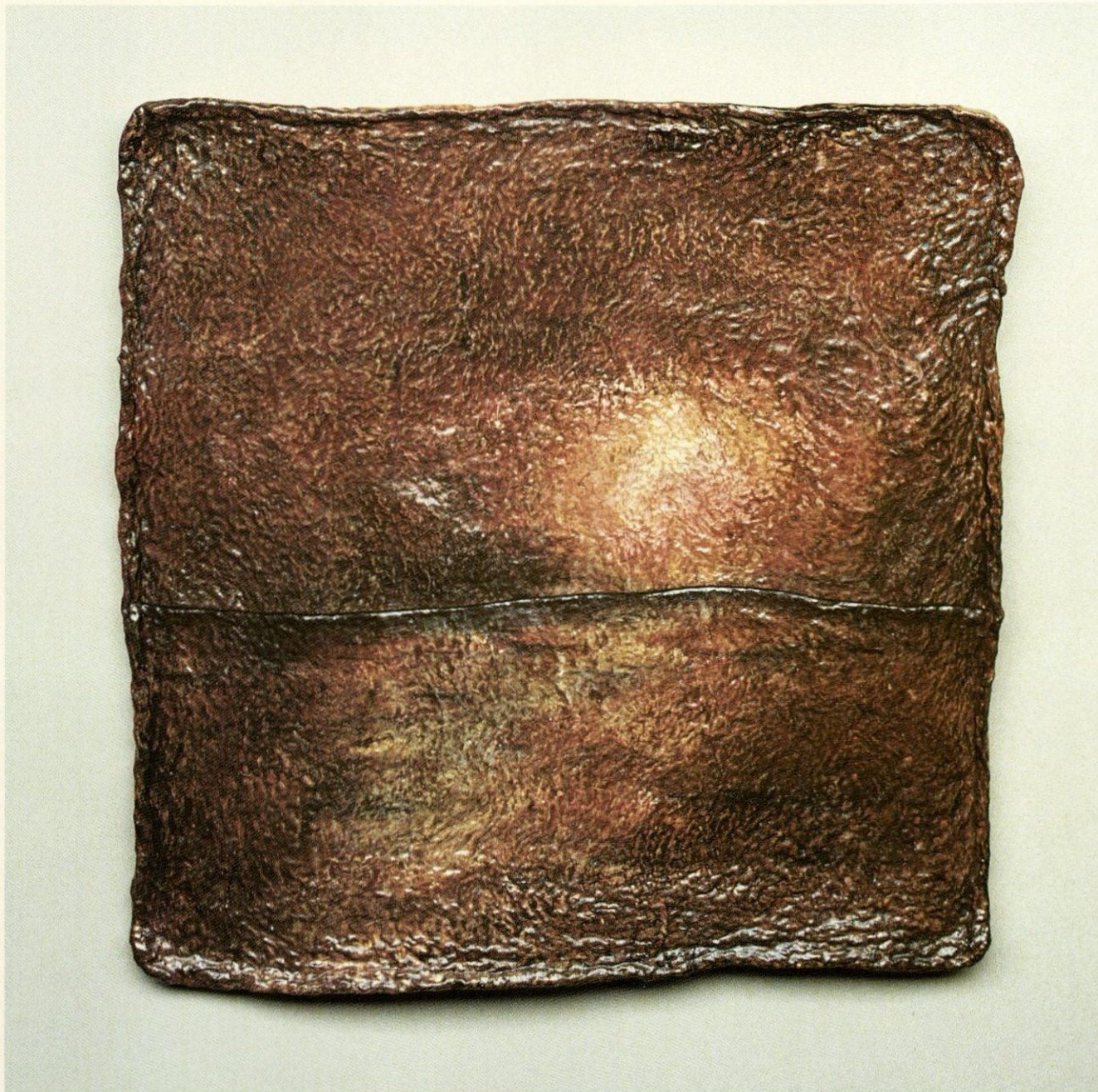
40 cm. Horizon, watercolor and acrylic on hand cast paper, 15 3/4 x 15 3/4"