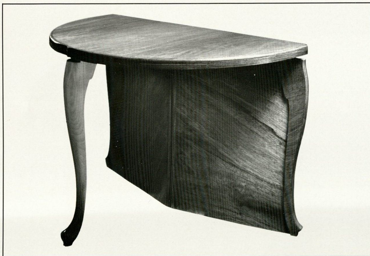
Small Tables, 1993, mahogany plywood ; claw-foot table—15 x 30 x 37"; cabriole-leg table—27 x 39 x 25"