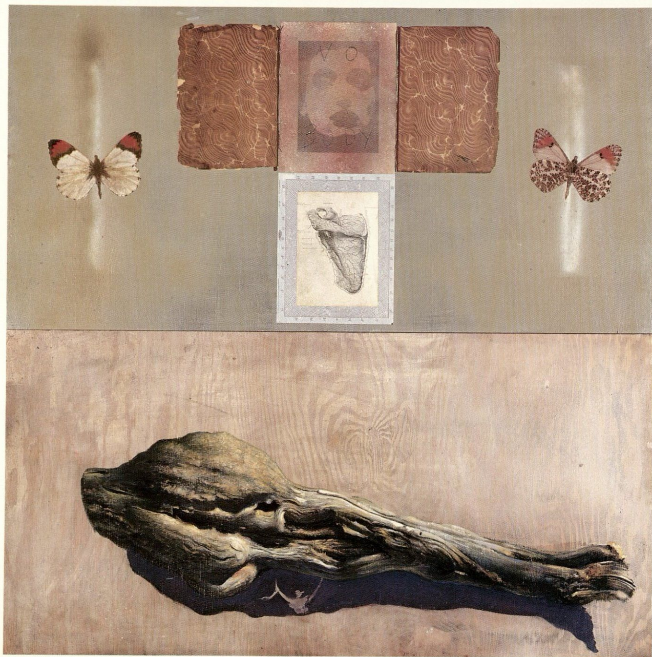
Nobody II, mixed media , 48 x 48"