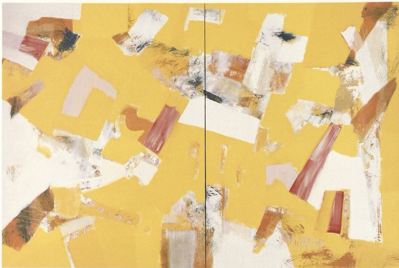
Agropoli, 1993, oil on linen, 84 x 128"