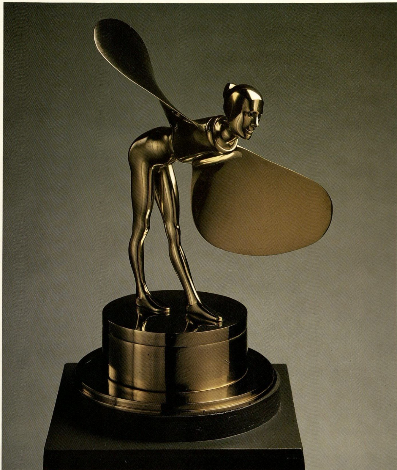
Nike, 1992, bronze, 12 x 6 x 7"