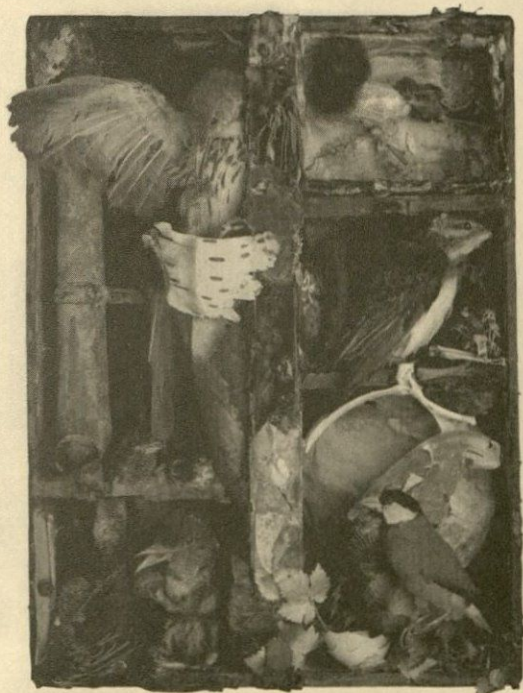
Rosamond Wolff Purcell, Case of Birds , 1988, photograph, was the cover illustration for The Sciences , July–August, 1993. Private collection.

In commemoration of the 35th anniversary of The Sciences magazine, this exhibition presents original art works that illustrated its pages. Seen in this cultural context, these art works provide visual metaphors that echo current debates in science and society.