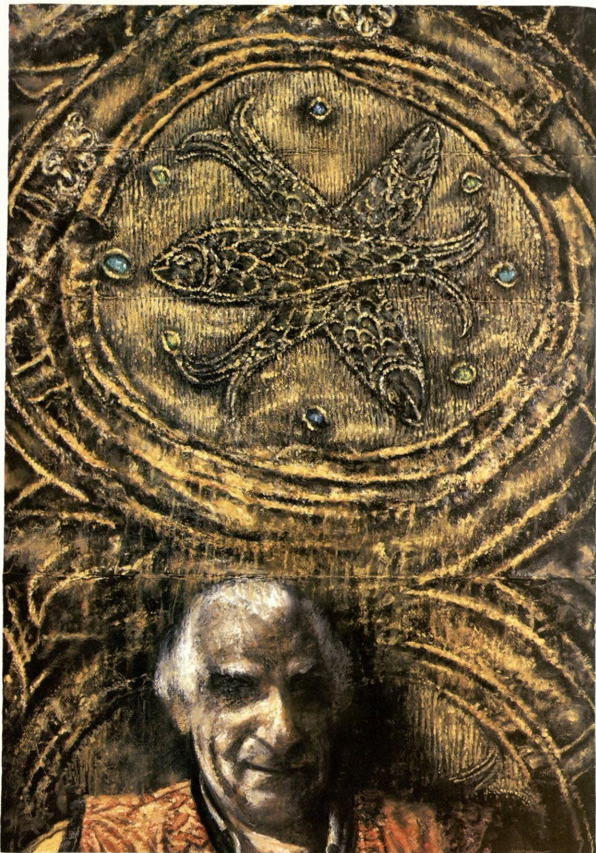
Serres in Prague , 1994, pastel and oilstick, 39½" x 27¾"