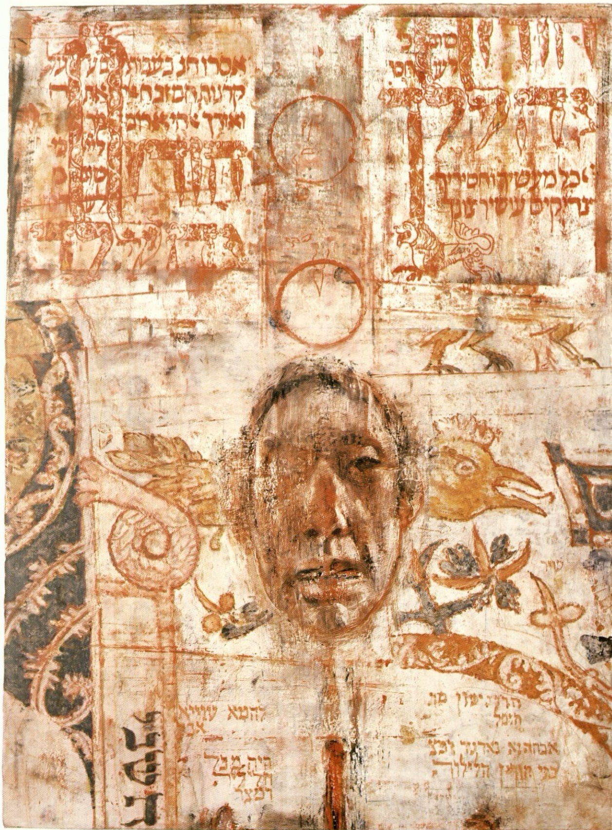
S.P. in Moravia, 1995, pastel and oilstick, 30"x22"