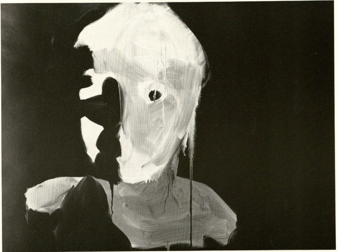
18 x 24" (right panel)