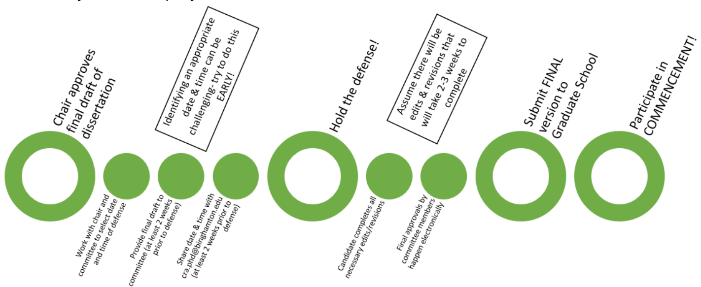
Illustration of the Final Steps of the Dissertation Process

Preferably at least one month in advance of the Defense, but not less than 14 days in advance, doctoral candidates must share the specific day and time the defense will be held by submitting Milestone 4 via Brightspace . According to Graduate School policy, the Dissertation Defense must be a public examination and open to any who wish to observe . Therefore, the date, time, and location (in-person or virtual) must be shared broadly (typically via email on CCPA listservs). On Milestone 4, you will need to provide: