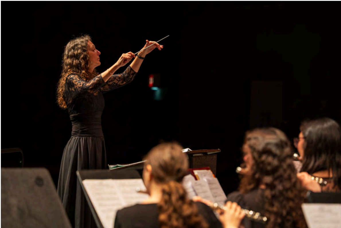
Wind Symphony Concert - Spring 2026