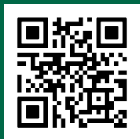
FOOD FACTS FOR CONSUMERS